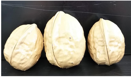
fig.2 Fake walnut(colored) We put real walnut fruits inside it.