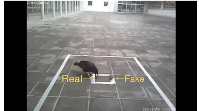
fig.5 The action of the crows The left walnut is real, and the right one is fake.

From this result, we think the crow knows real walnuts and fake ones.